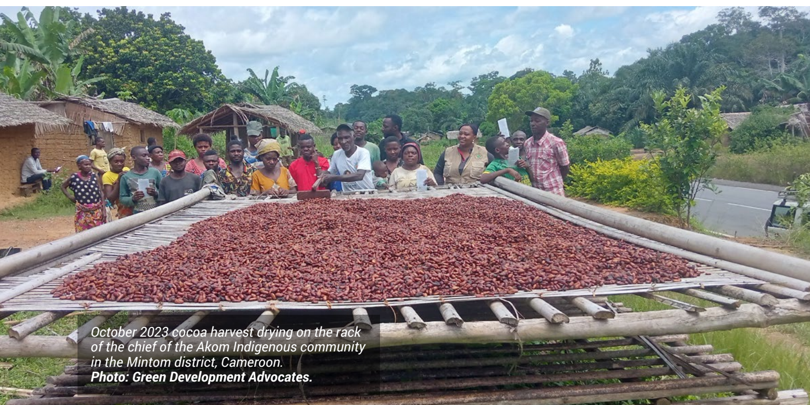
October 2023 cocoa harvest drying on the rack of the chief of the Akom Indigenous community in the Mintom district, Cameroon.