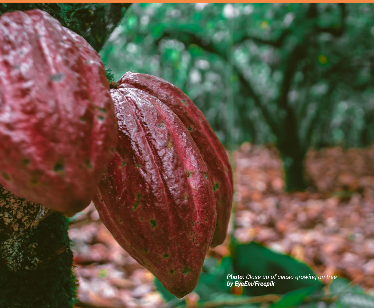
Photo: Close-up of cacao growing on tree

questions, concerns and priorities from smallholder farmers