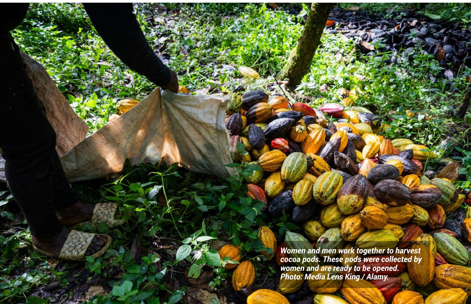
Women and men work together to harvest cocoa pods. These pods were collected by women and are ready to be opened.