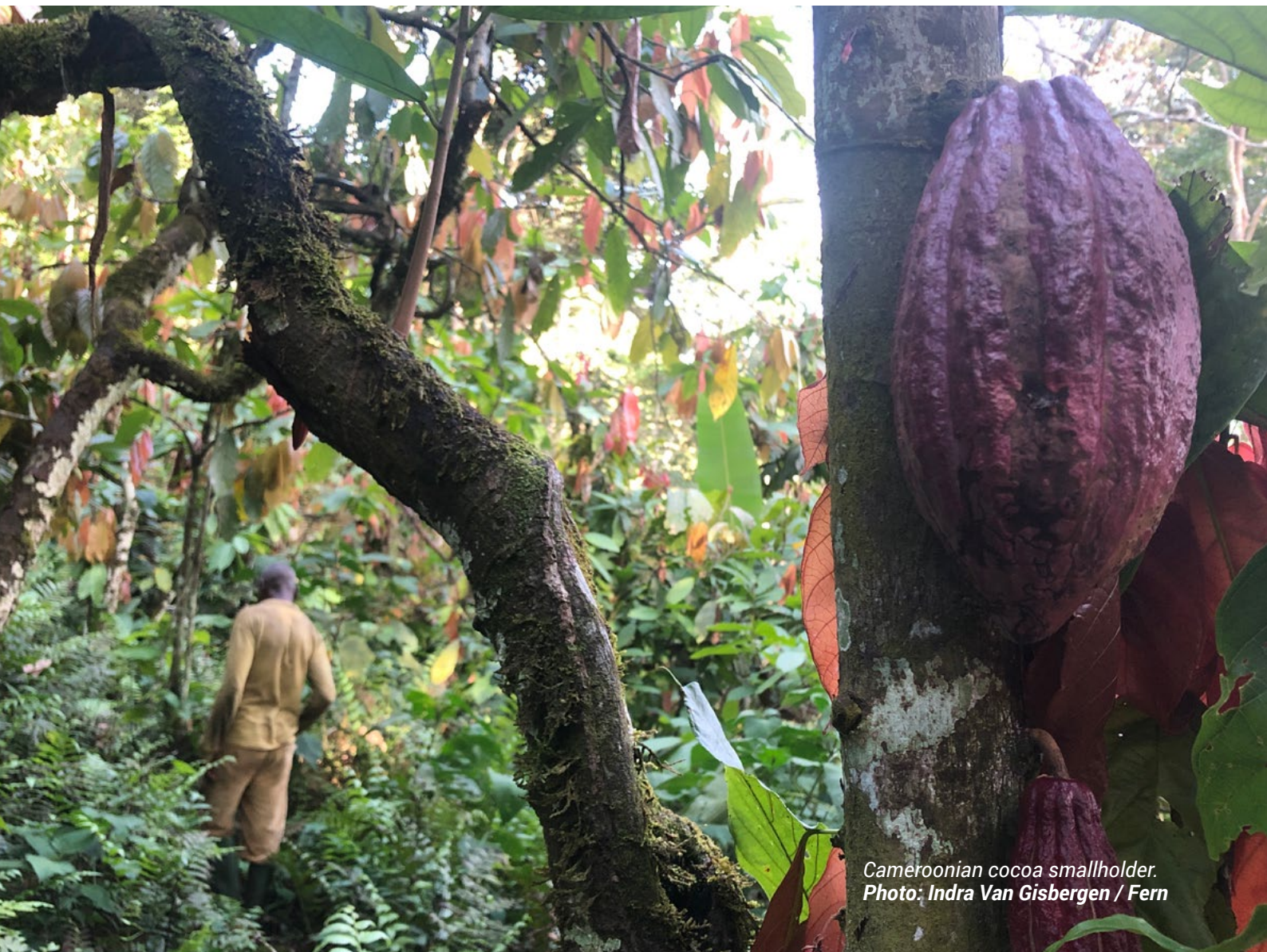
Cameroonian cocoa smallholder.

NGO Comment: The practical questions raised here highlight the complexity of enacting a rigorous deforestation-free standard in a complex and often unclear local context. Urgent work is needed to clarify and communicate widely what is legal cocoa, to support farmers in regularising their land claims, and to record existing fallow fields. Some issues, such as compulsory relocation, make it clear that implementing deforestation-free production in practice will require cooperation and consideration from actors beyond the Ministry of Agriculture and Development (MINADER) and the Ministry of Commerce.