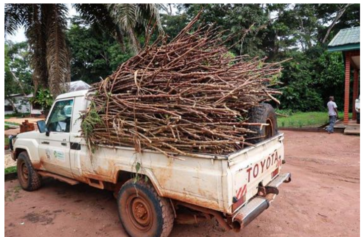
More than 20.000 manioc stems were distributed