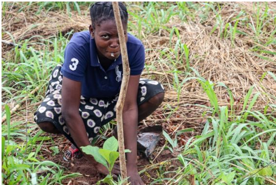
and planting it

We have completed the field missions for the wildlife inventory. Throughout the month, ecoguard teams helped with the collection of camera traps from two sectors. All camera traps should be returned by the end of October.