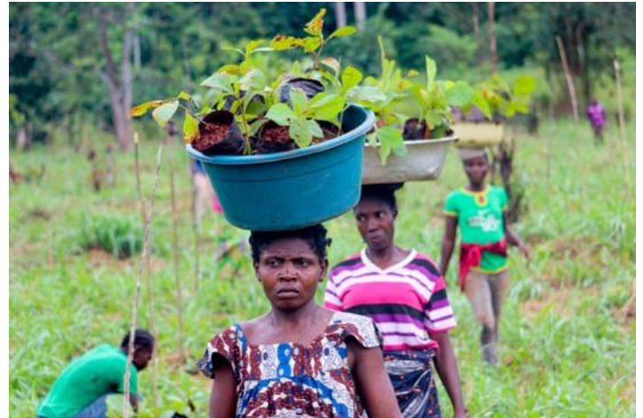
...transporting... © Christian Bassoum