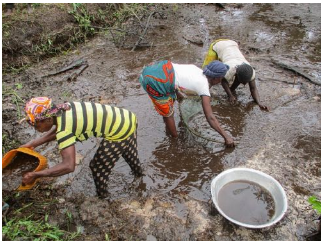
The new fish farm activity

We also supported a fish farming project. We have stocked almost 2000 fry in 18 ponds, covering an overall area of approximately 5.635 m 2 in Monassao, Nguengueli, Babongo and Mossapoula villages. A social agreement will be signed with the beneficiaries in order to perpetuate action of supplying local markets with fish, as a substitute for bushmeat.