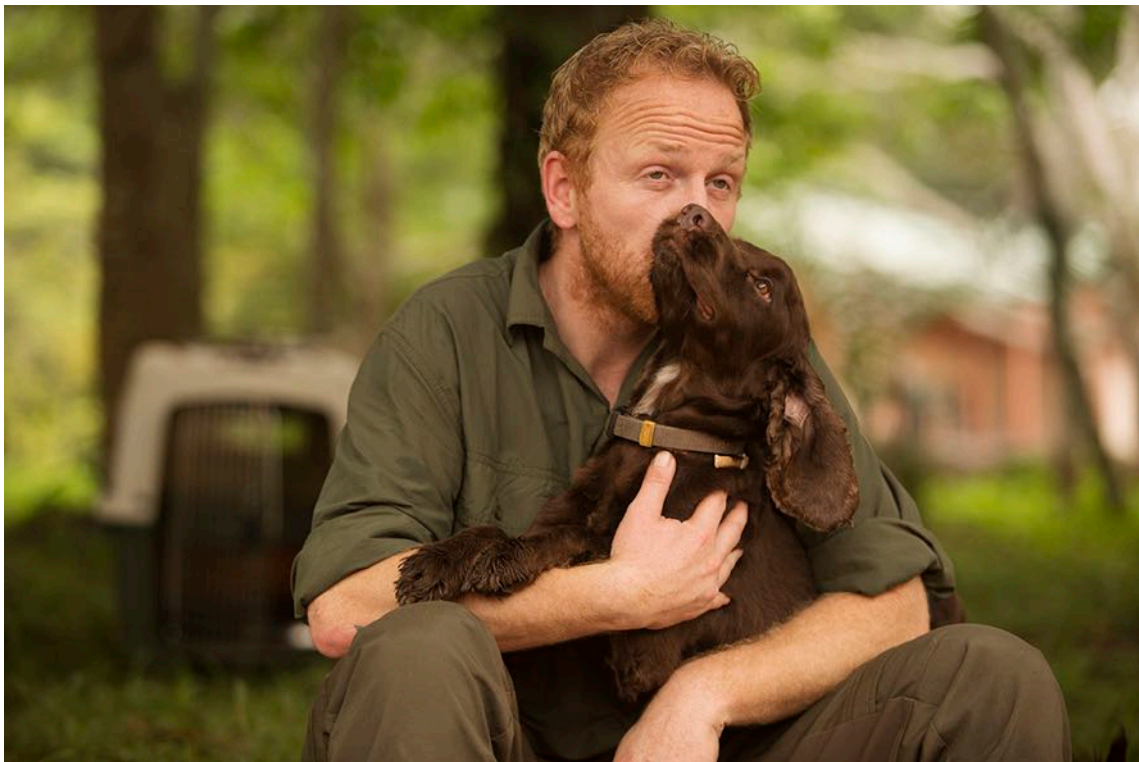
Mitch

Mitch, one of the dogs who worked with us for almost two years and who had to be evacuated to the Netherlands last July to treat an infection, has unfortunately been euthanized to avoid suffering. Veterinarians were unable to find the cause for his illness.