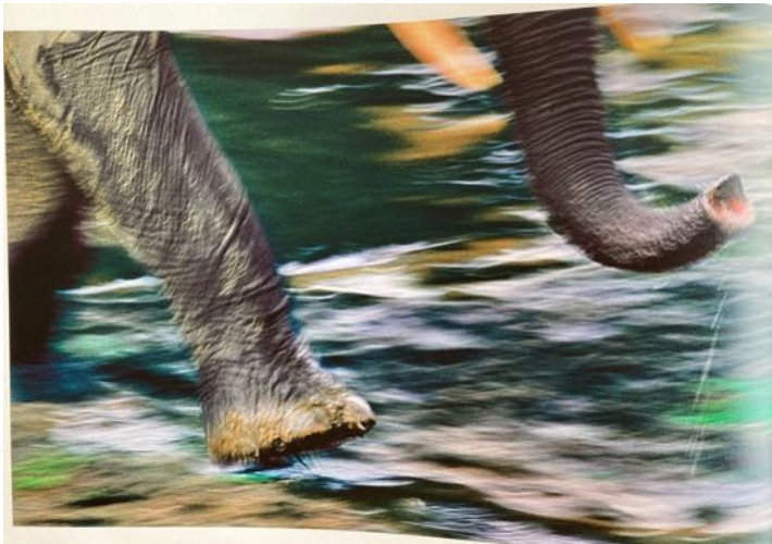
A signed copy of the book WILD by photographer Michael Nichols.