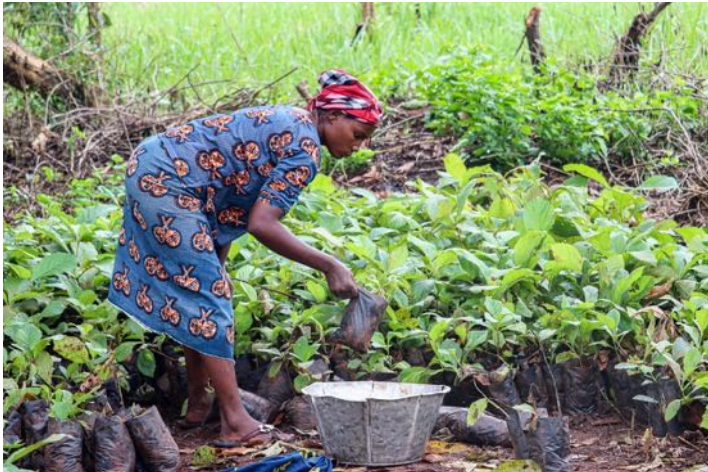
Choosing the future tree...

We planted about 8,000 trees within a 20ha area in an effort to restore degraded forest within the agricultural zone in DSPA. Funding for this restoration project was provided by the Peter and Luise Hager Foundation (Peter und Luise Hager-Stiftung) through WWF Germany. We also maintained previously planted trees. A total of 176 people from the local community (most of them women) were involved in this project