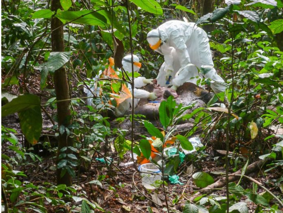
Collecting samples with all the security measures

Two carcasses, a baby elephant and a bongo were found in the forest by the gorilla tracking team, dead from natural causes. Samples were collected by the veterinary team for laboratory analyses.