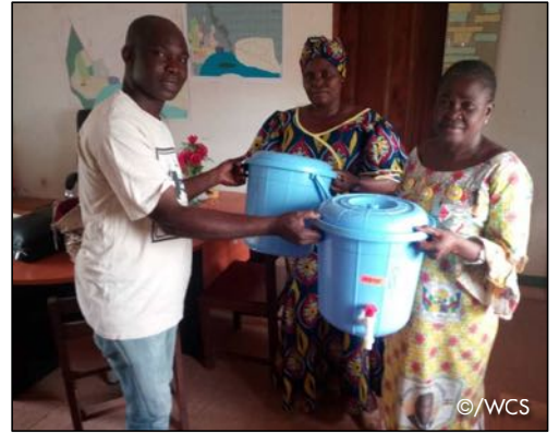
Donation of handwashing equipment to the Sub-Prefecture of Kabo District.