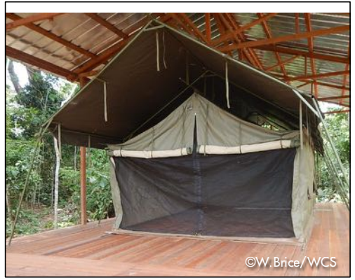
One of two new accommodation platforms ready to welcome Park visitors as soon as the containment measures are lifted.