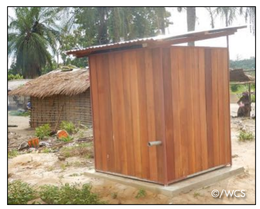
As part of a joint project between the Park, CIB and the Bomassa Village Committee, six public latrines have been installed in Bomassa and Bon-Coin.