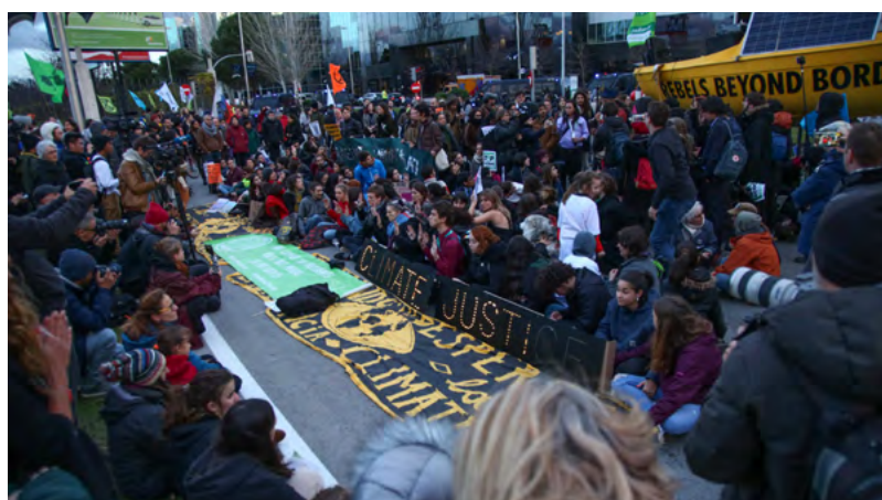
As the negotiations continued at the 2019 Climate Change Conference in Madrid, members of Extinction Rebellion and Fridays For Future staged a large protest, calling the meeting “another lost opportunity.”

The history of the UNFCCC offers valuable lessons for future cooperation: reaching agreement may not be the main