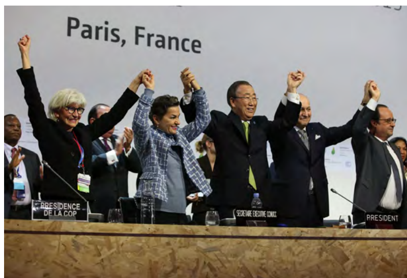
Laurence Tubiana, COP 21 Presidency; UNFCCC Executive Secretary Christiana Figueres; UN Secretary-General Ban Ki-moon; COP 21/CMP 11 President Laurent Fabius, Foreign Minister, France; and President François Hollande, France, celebrate the adoption of the Paris Agreement in December 2015.

The 2015 Paris Agreement is the first multilateral climate change agreement that places legally binding obligations on emission reductions on all countries. It maintains the developed countries’ leadership role in finance (Article 9) and requires them to