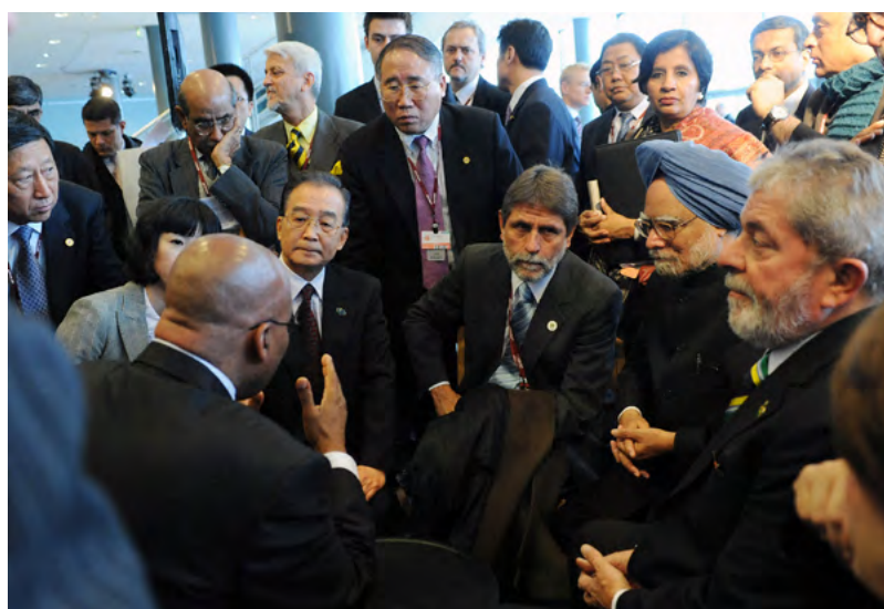
Heads of state during informal consultations in Copenhagen in 2009. From left to right in circle: South African President Jacob Zuma (back of head), Chinese Premier Wen Jiabao, Indian Prime Minister Manmohan Singh (in turban), and Brazilian President Luiz Inácio Lula da Silva (front right).

Expectations were high for the 2009 Copenhagen Climate Change Conference, where the new agreement was supposed to be adopted. Adding weight to the task, the IPCC’s Fourth Assessment Report concluded “warming of the climate system is unequivocal”