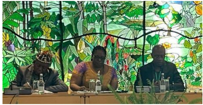
Participants during plenary discussions on day 1