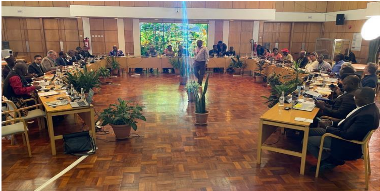
Plenary Meeting Room at ICRAF in Nairobi

This Nairobi meeting constituted the first in-person meeting of the Science Panel for the Congo Basin since its official launch at COP28 in December 2023. It convened members of the Panel's Scientific Steering Committee, as well as additional lead authors for the 2025 Assessment Report. While not all members of the SSC were able to come to Nairobi, the turnout was high with a total of 24 participants, including scientists from all six countries in the Congo Basin: Cameroon, Central African Republic, the Democratic Republic of Congo, Equatorial Guinea, Gabon, and the Republic of Congo. In addition, the scientists were joined by the recently appointed Special Envoy for the Panel, Dr. Lee White, and members of the Secretariat at SDSN.