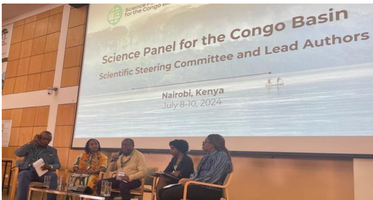
Panel speakers on the role of Indigenous knowledge and autochthone communities