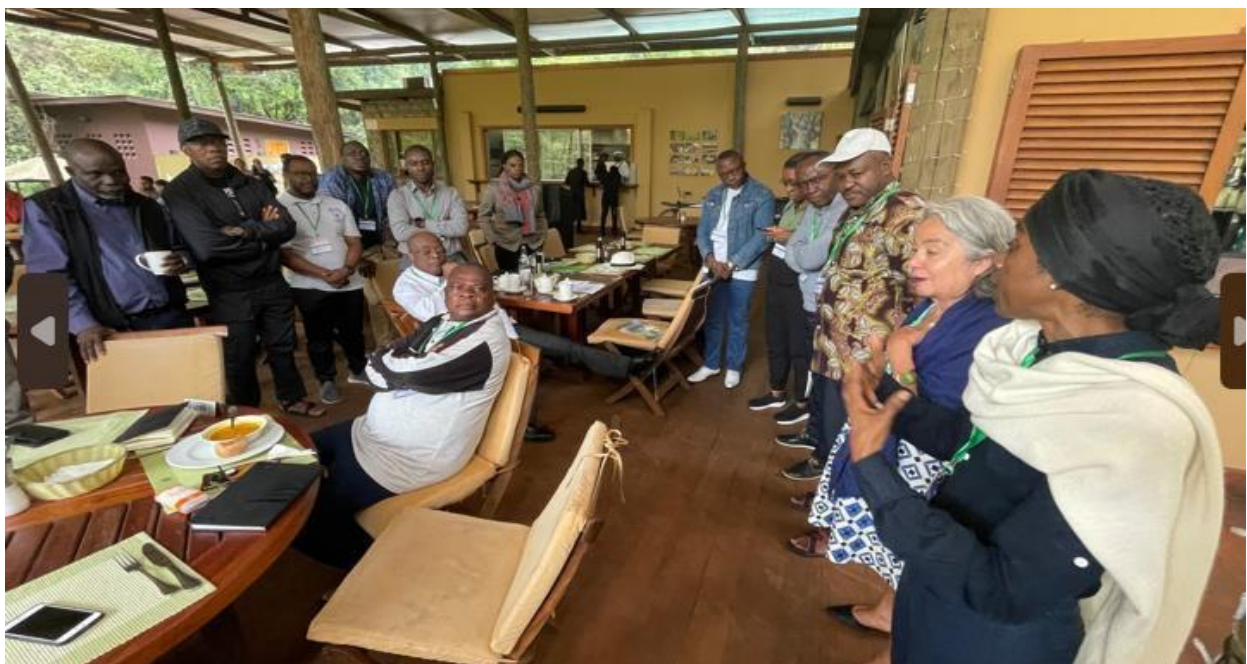
Concluding appreciation of Co-Chairs and Secretariat