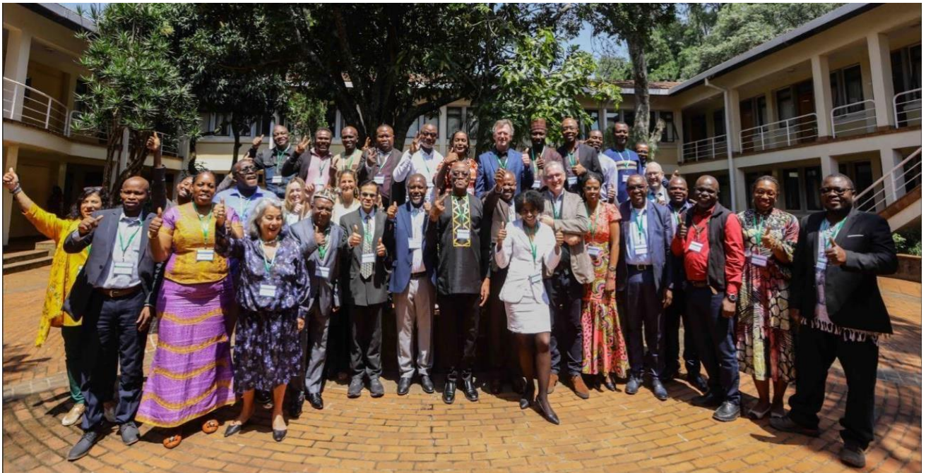
Group photo with all participants, including Co-Chairs, Special Envoy, members of the Scientific Steering Committee, Lead Authors, Secretariat, and organizing team.

For additional information please contact the Secretariat at info@SPCongoBasin.org .