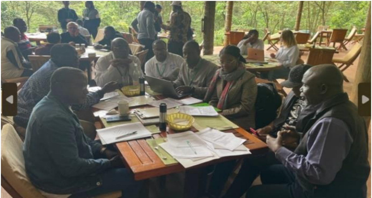
Final discussions in the working groups at Karura Forest