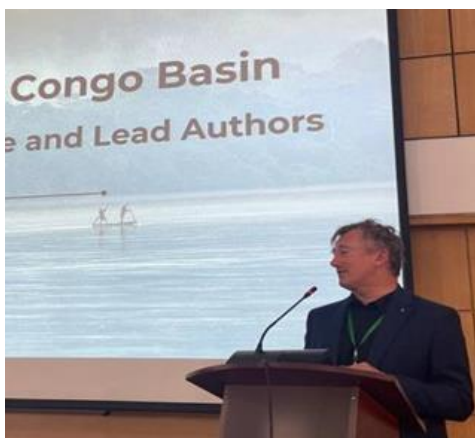
SPCB Special Envoy Dr Lee White

Together in both working groups and the plenary, the participants took advantage of the allocated time to discuss and explore a joint way forward on almost all decision items. Agreements could indeed be found on most issues, with few specific items deferred to processes that also involve Section Coordinators who were not present in Nairobi. A preliminary overview of these decisions is listed below; the Secretariat will further share revised documents that reflect the discussions on the assessment report.