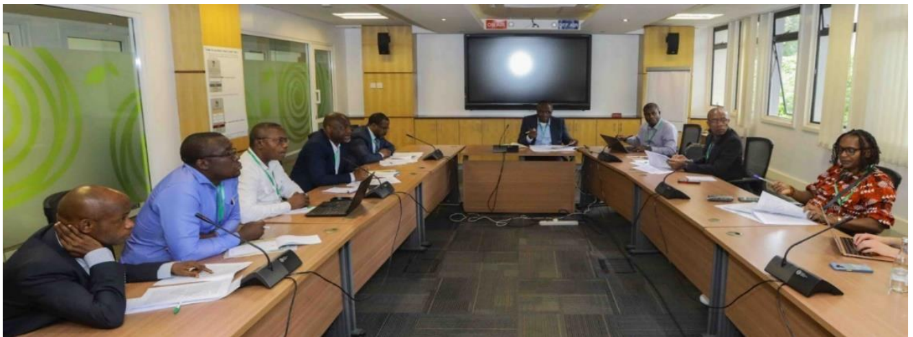
Working Group discussion of Section 2 Coordinators and lead authors

It was discussed and agreed to replace the proposed editorial guidelines with the referencing style of a lead journal (e.g. Science, Nature, Placebo, APA, etc.), to be proposed and agreed by the Co- Chairs following the meeting.