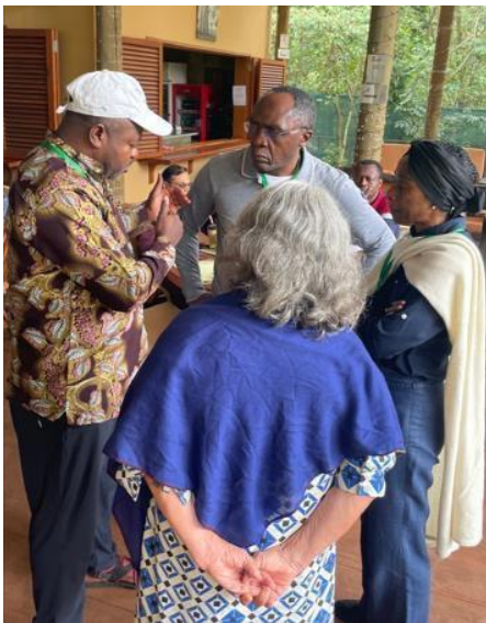
Discussions among the three Co-Chairs and the Strategic Coordinator.

Overview of proposed Honoraria for AR authors: Co-chairs and Secretariat provided a verbal summary of a proposed approach to provide basic honoraria to the authors of the AR, in line with earlier discussions and against the possibilities in the SPCB budget. Based on the feedback the Secretariat will work with the Co-Chairs on a formal approach and explore concrete parameters to operationalize the honoraria payments accordingly.