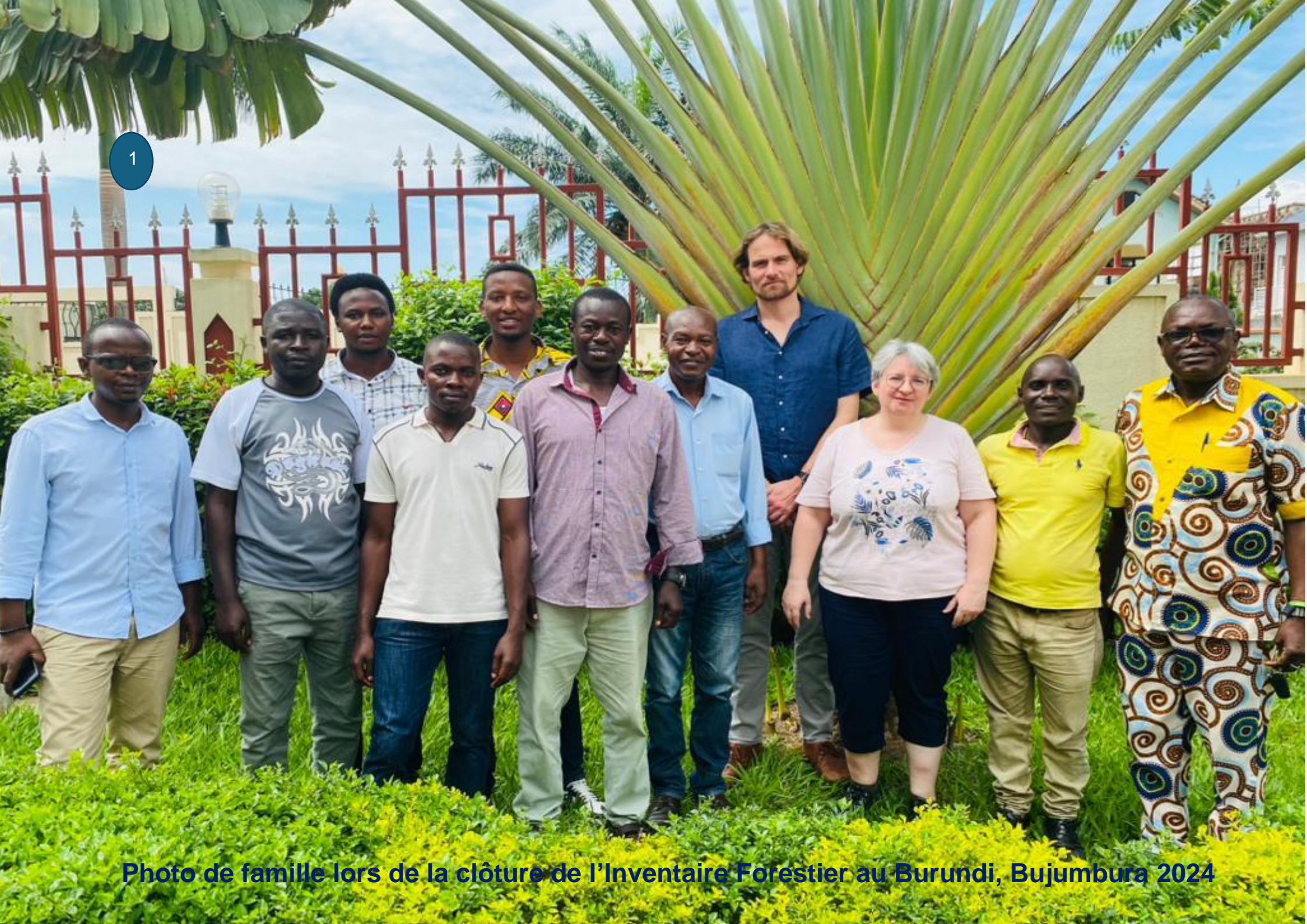
Photo de famille lors de la clôture de l'Inventaire Forestier au Burundi, Bujumbura 2024